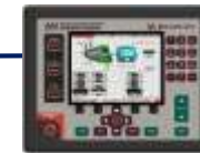
505/505E Single Extraction Turbine Control