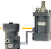
VariStroke Actuator (Remote Servo)