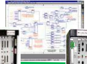
GAP Graphical Application Programmer