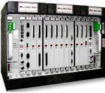
MicroNet-Plus Dual Redundant Control