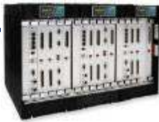
5009FT Fault Tolerant Control