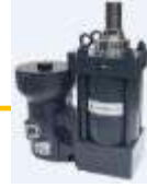
VariStroke-I Actuator (Integrated)