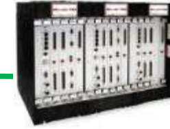
MicroNet TMR Fault Tolerant Control