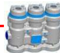
QuickTrip Trip Block Assembly