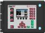
Peak200 Mechanical Drive Speed Control