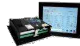
505CC-2 Integrated Turbine & Compressor Control