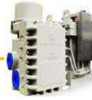
VariStroke-II Actuator (Integrated)